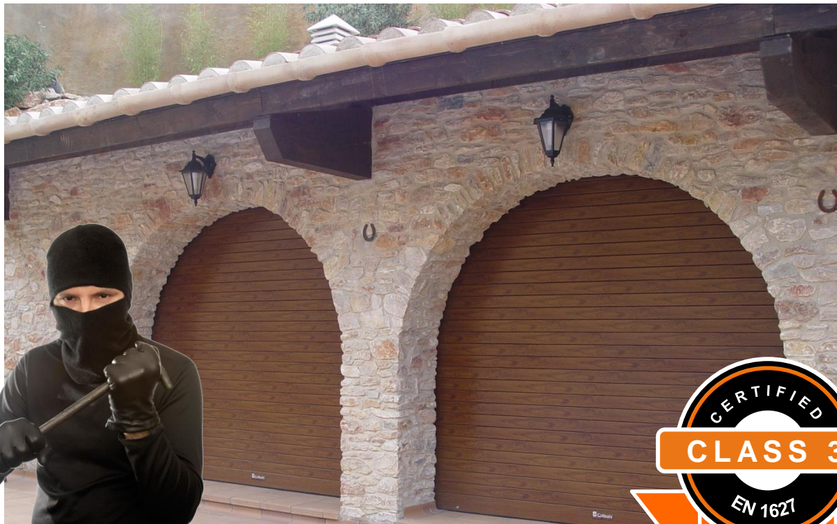
SECURBAIX THERMAL in wooden lacquered finish