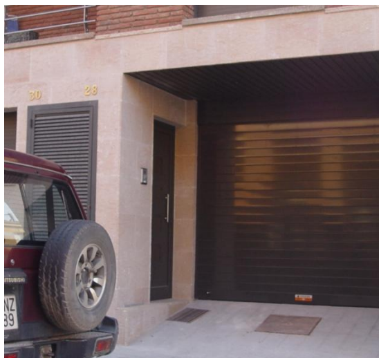
SECURBAIX THERMAL in 9011 RAL finish

SECURBAIX THERMIC has been exclusively designed for garages where a high level of burglar-proof protection is required, as well as thermal and acoustic insulation.