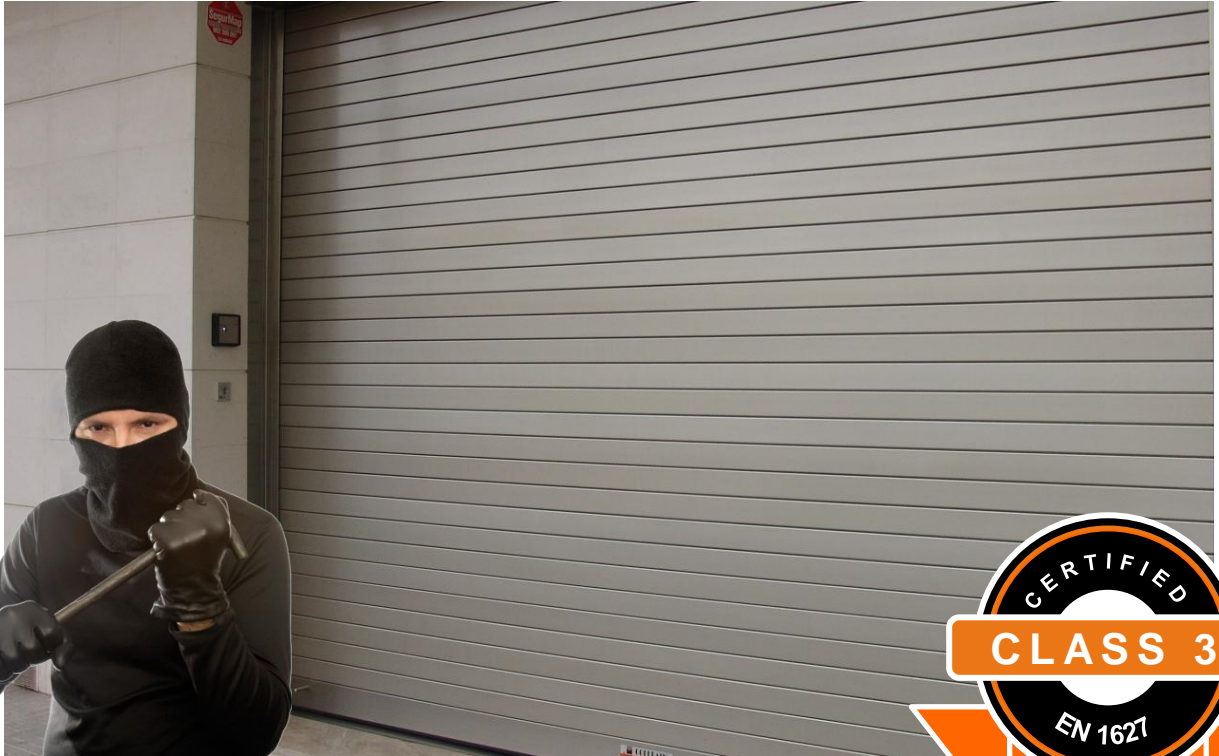
SECURBAIX model in Matt Silver anodized finish