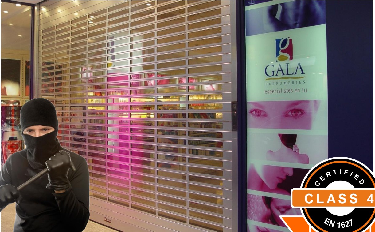
SECURBAIX BL VISION XL in Matt Silver Anodized finish