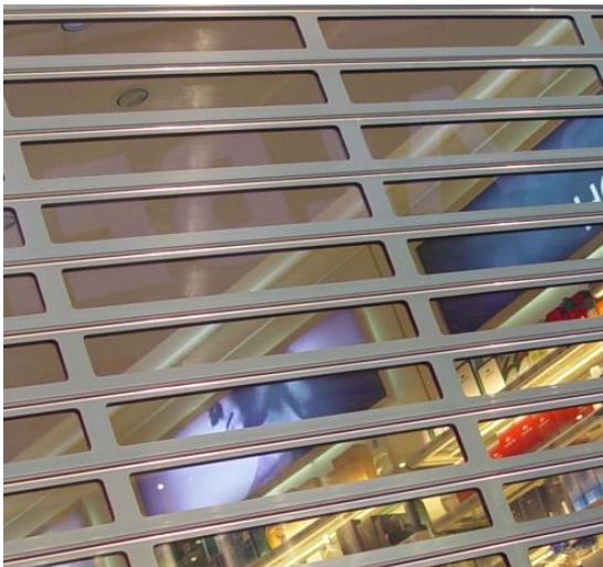
Security and transparency can go together at last.