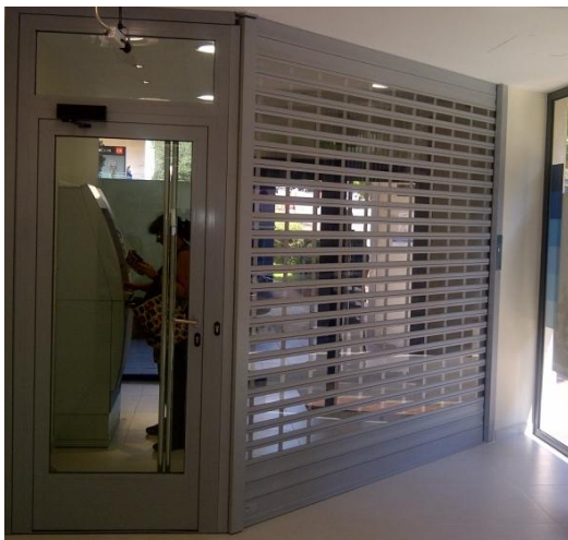
SECURBAIX BL VISION in Matt Silver Anodized finish

SECURBAIX BL VISION has been specifically designed to provide high security protection and vision in your buildings and retail premises.