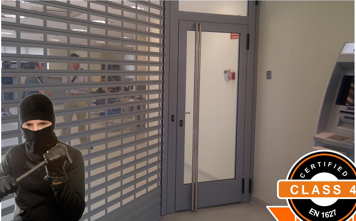
SECURBAIX BL VISION in a bank