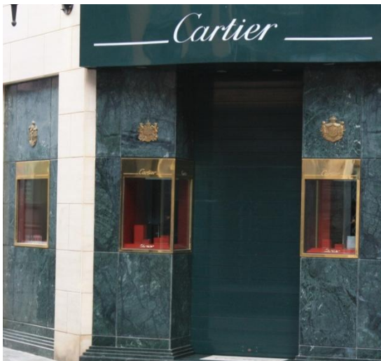
SECURBAIX BL in 6009 RAL finish