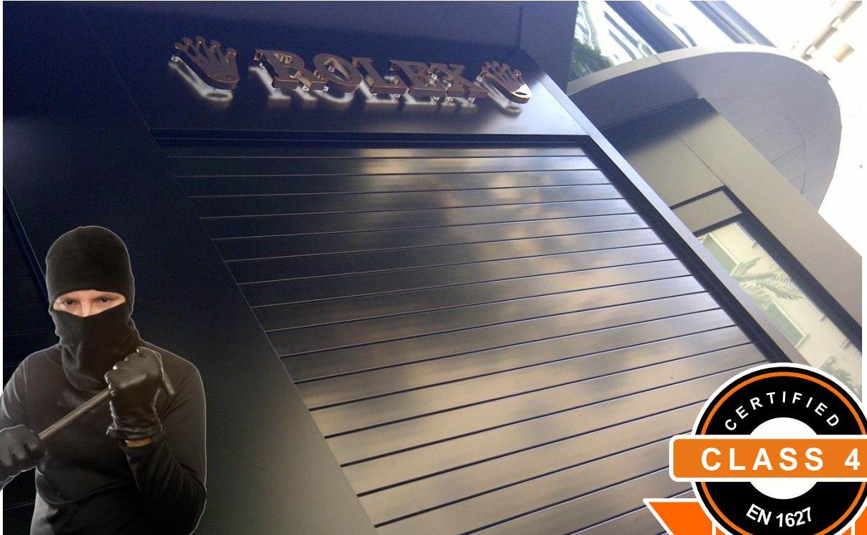
SECURBAIX BL in Shiny Silver anodized finish