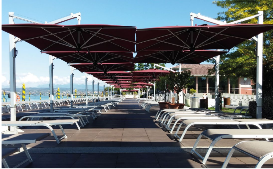
TERME DI SIRMIONE- BRESCIA