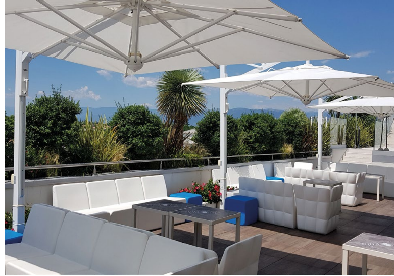
TERRAZZA MOVIDA CASTIGLIONE DI LORIA - TREVISO